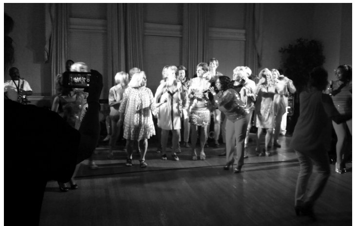
Liquid Pleasure 8-17-17