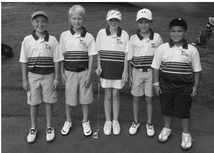
Junior Golf League