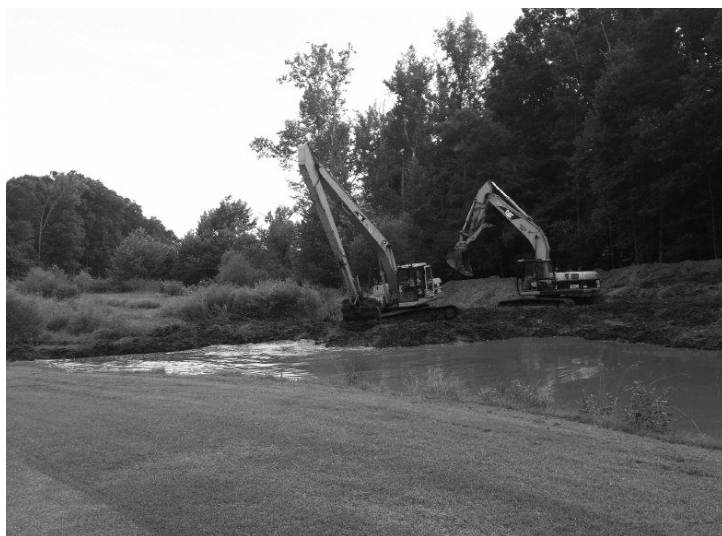
Dredging creek on hole 12