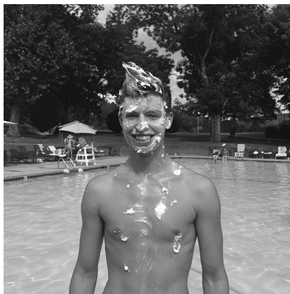
July 4th Celebration