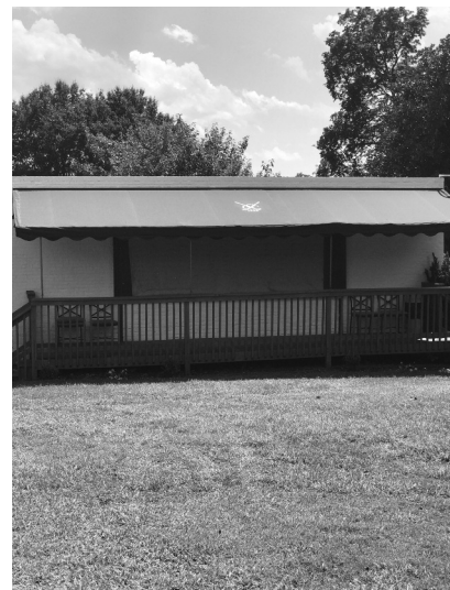
Check out the new scoreboard awning